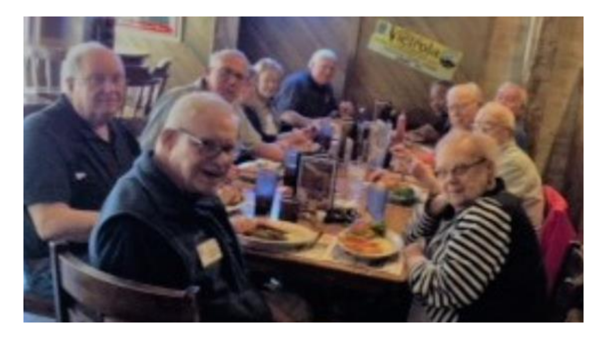
May - SE Luncheon