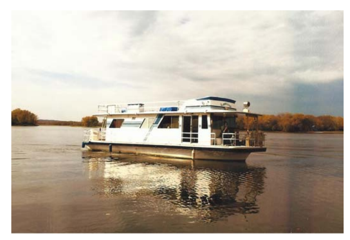
The Moore The Merrier